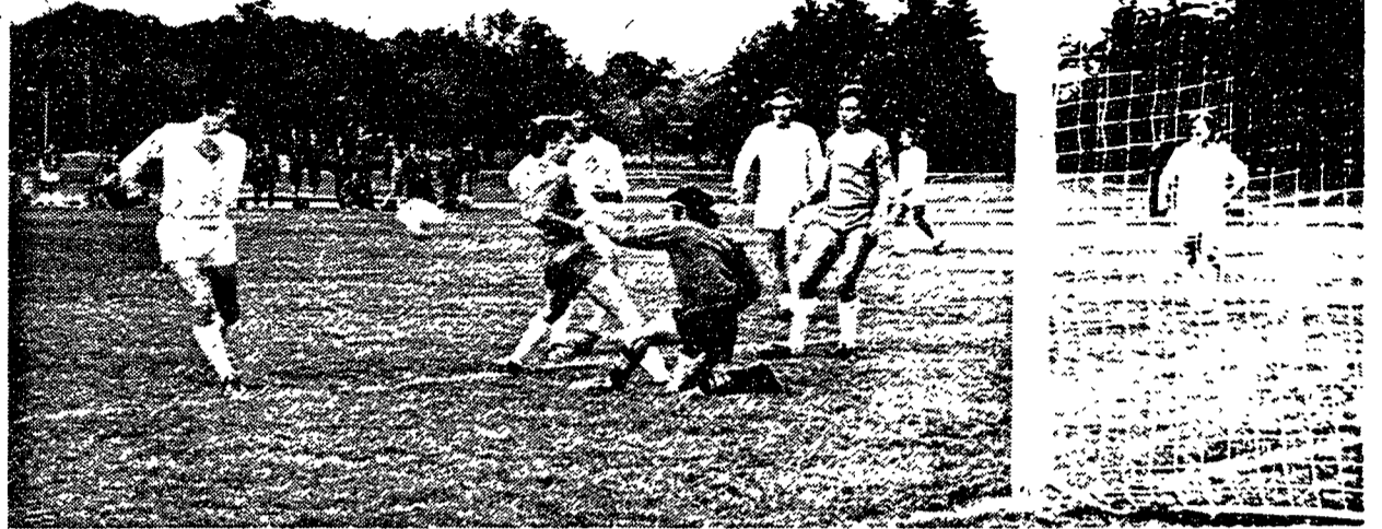
Behrend shows their fast pace attack as they converge on the opposing goalie.

Allegheny will be at Behrend for a rematch on Tuesday, October 15.