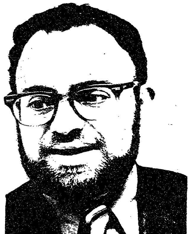
Stanton T. Friedman, nuclear physicist, will be lecturing on flying saucers this coming Wednesday, at 8 p.m. in the Reed Lecture Hall.

infamous Condon Report, Air Force data, UFO landings, humanoids, travel to the stars, the arguments of the educated non-believers, etc. His talk will be followed by a question and answer session.