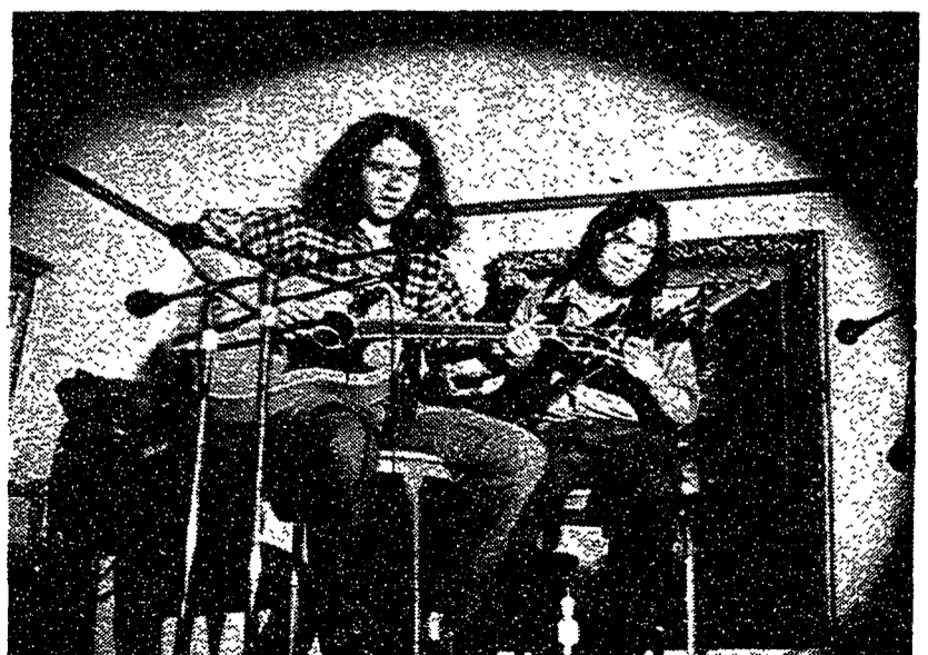
To start the Spring Arts weekend last week a Jammy was sponsored by the Freshman Class. Behrend students and local talent had a good chance to entertain the Behrend community.