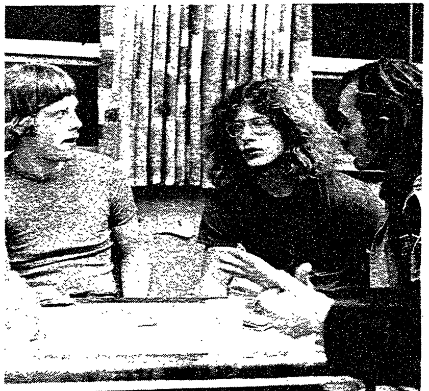
Behrend students had a change of pace from their usual Saturday night last week when the Student Union Board sponsored Las Vegas Night. Card tables and other vice games were set up throughout the RUB.