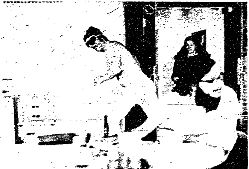
Is it a bird? Is it a plane? Would you believe a Behrend student streaking faster than a speeding bullet through dinner one night last week?