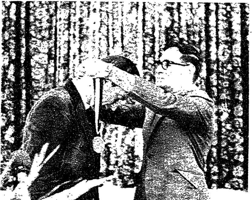
Capt. Weitz receiving First Behrend Medallion at luncheon held in his honor this past Sunday, here at Behrend.

The inscription on Capt. Weitz' meddallion reads: "Presented to CAPTAIN PAUL J. WEITZ, October 7, 1973, for distinguished service to society and eminence in his chosen field. He has brought honor to himself, his community and to mankind as one of America's first Sky-Lab Astronauts."