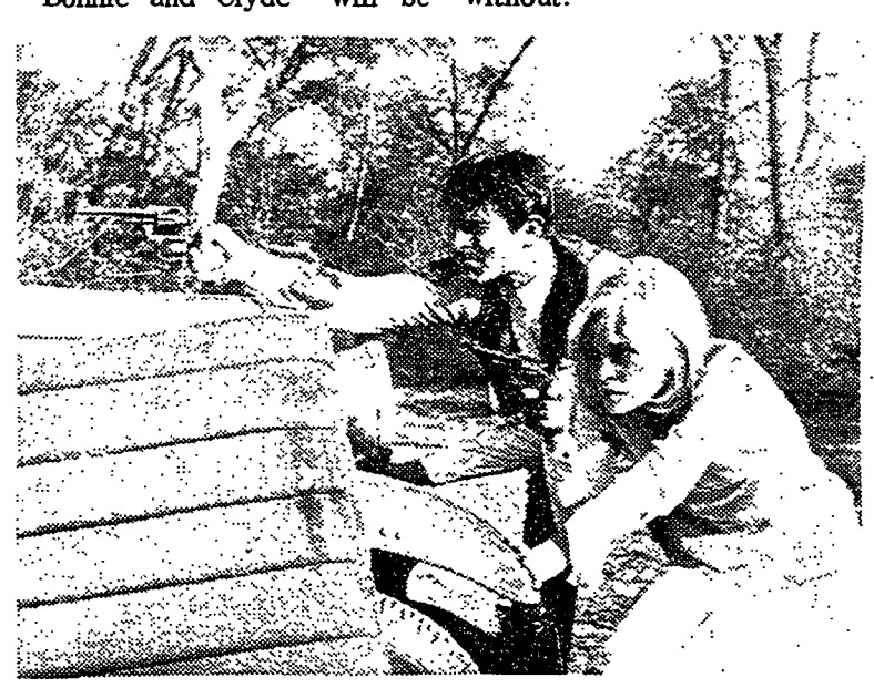
"Bonnie and Clyde"—they're young, they're in love, they kill people. There will be two showings in the RUB, Sunday, November 26, 7 and 9 p.m.

showing in the RUB Lecture Hall, Nov. 26, at 7:00 and 9:00. Admission is 35 cents with an activity card and one dollar without.