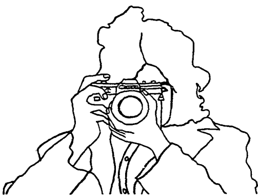
THE CANON MAN'S AT GANNON

GRAVEL GRAVEL GRAVEL GRAVEL GRAVEL GRAVEL GRAVEL GRAVEL GRAVEL GRAVEL GRAVEL GRAVEL