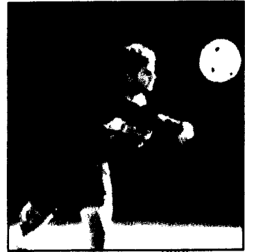
Bolea had 13 saves in the AMCC playoff games.

for improvement during the 2011 season with the Behrend Lions' as the team is wrapping up their postseason in ECAC play this upcoming week.