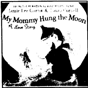
My Mommy Hung the Moon by Jamie Lee Curtis and Laura Cornell

The pair has collaborated eight other children's books available, including Is There Really a Human Race , Where Do Balloons Go? , and It's Hard to Be Five .