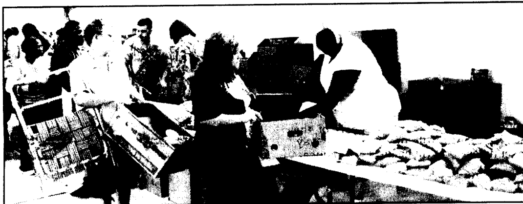
Increased use of food banks has become common across the country as poverty has risen.

The report on the economic well-being of US citizens during 2009, which was President Barack Obama's first year, followed a recession that left millions of people jobless. The poverty line is defined by the US government as a family of four living on less than $22k a year. This figure shows that the rate of poverty this last year was the highest since