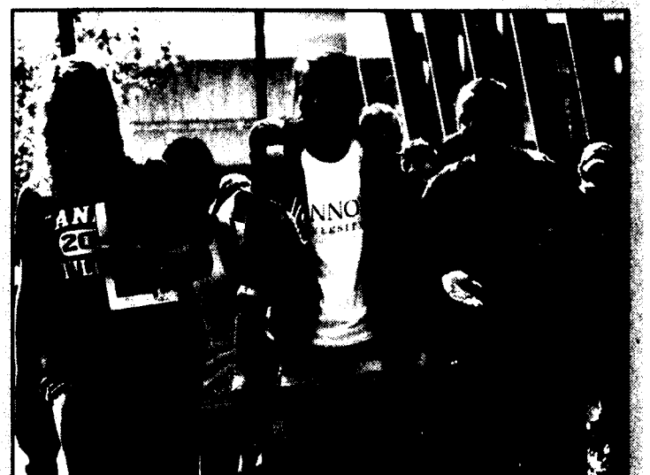
Students hear the new speaker system as they walk to class.

When SGA held the vote to increase funding for the speaker project last spring, Panighetti said eight students attended the Students' Voice