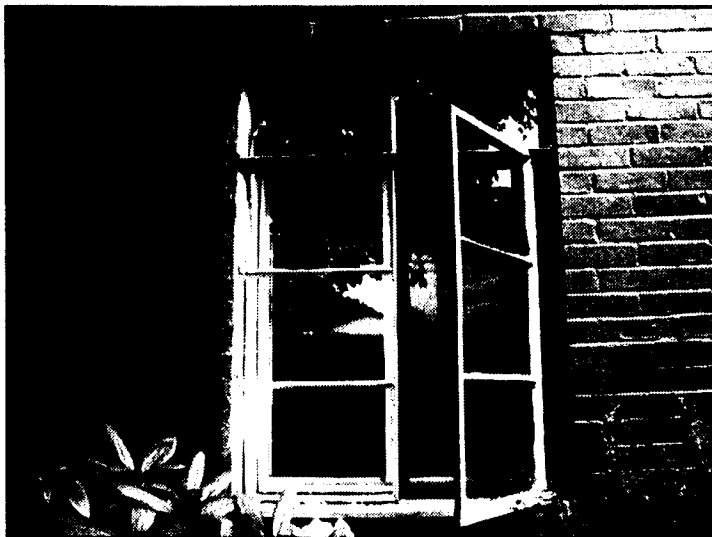
New windows with energy-efficient glass decorate the renovated apartment buildings.

Last year, numerous Highland Square residents complained about dismal housing conditions within the first few