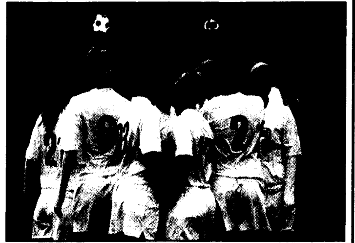
Women's soccer look for another victorious season after a winning season opener.

So much talent and so much success over the years, the Lady Lions are equipped to win another section title. With the continuation of such dedication and persistence, the girls will advance to the NCAA tournament, and make a permanent mark in the Penn State Behrend record books.