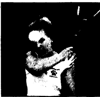
PSBLions.com Tennis kicked off their season with a win over Medaille.

The team hopes to keep their streak of five consecutive AMCC conference titles, a feat untouched by any other women's tennis team in Behrend history. Hopefully the lions can make it six in a row as four starters are return-