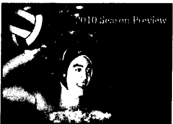
Water polo starts their season in Annapolis, Md.

Towards the end of September, Behrend will shift focus to local teams in hopes to go after a 2010 Championship Crown.