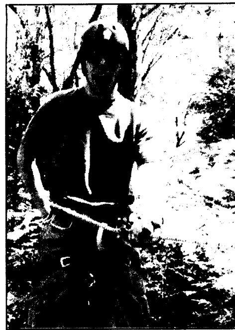
Left: Cadet pictured on the first day of physical training.