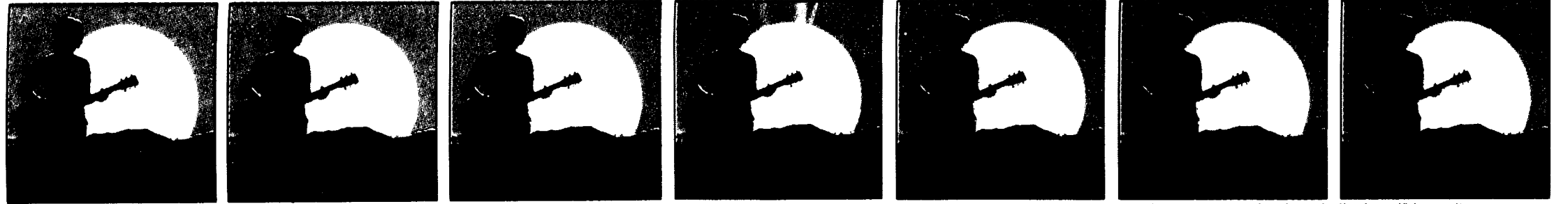
http://beatcrave.com/tag/coachella ; http://blogs.citypages.com

They're obviously doing great things in the music industry, or Coachella wouldn't sign them to perform. Check them out, and see what you think. If you're anything like me, their music will make your day on some days and be exactly what you wanted to hear. Enjoy.