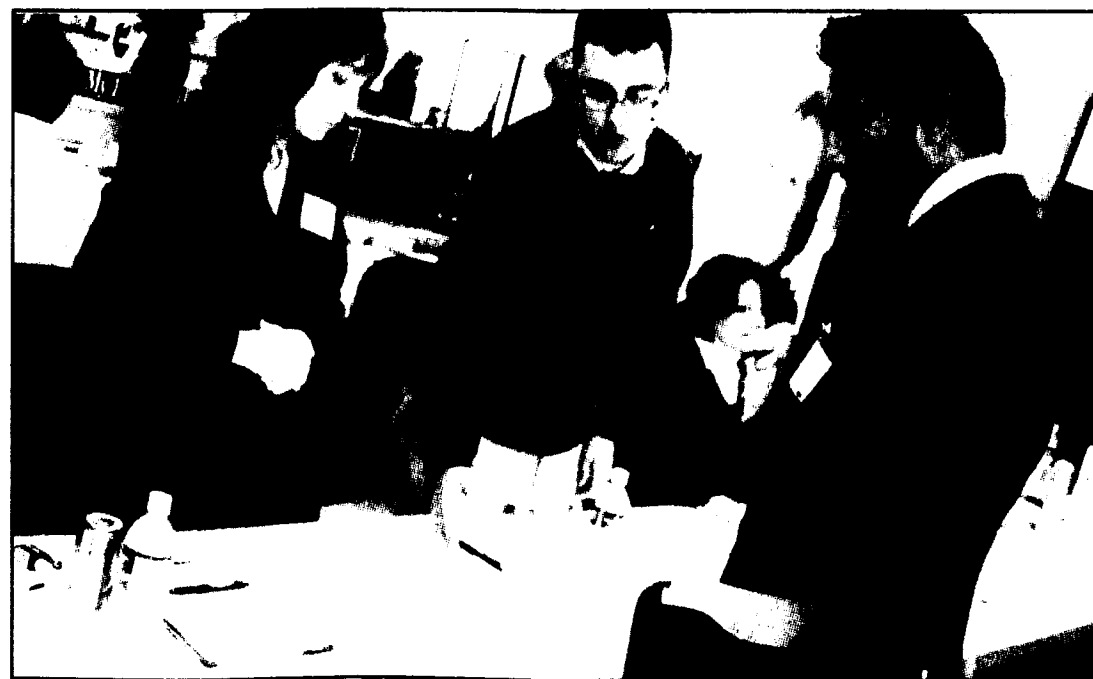
In McGarvey Commons students had the opportunity to explore a variety of career opportunities.

"I understand those are the degrees that Behrend pushes to publicize most, but you can't