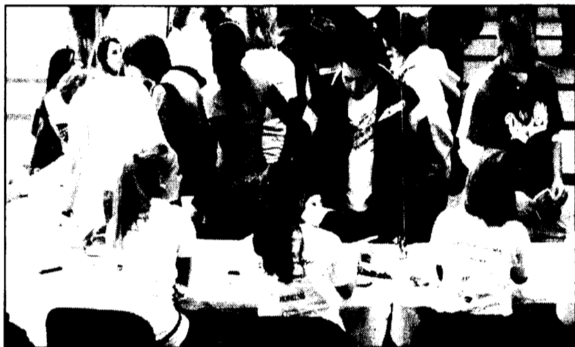
Behrend students enjoyed food and games while at the Breastival Festival.