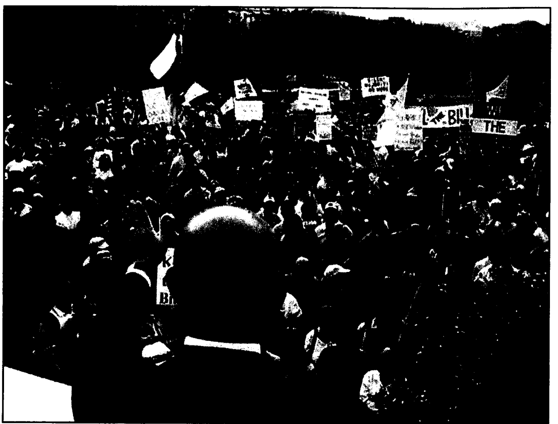
Protestors have taken violent steps in response to the health care bill passing.

Florida Representative Ginny Brown-Waite, also a Republican, was also drawn into the vio-