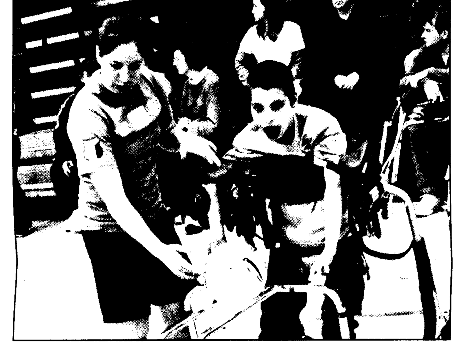
Behrend Students helped kids at all skill levels particpate in TOPS soccer

To help make the program work are 60-70 committed volunteers, coming from athletics to students on campus. "I heard about the program through