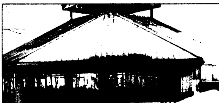
Preliminary reports state the fire was electrical and accidental.