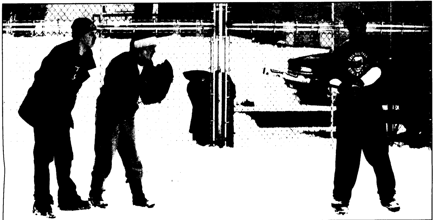
The Sigma Kappa Nu unrecognized organization of Behrend students participated in a snowball softball fundraising event to benefit the March of Dimes on Feb. 13 at Pulassi Park on East 12th Street and Hess Avenue. The teams consisted of SKN members and adult volunteers throughout Erie.