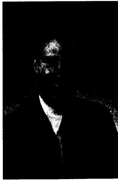
Republican Senator Scott Brown was recently elected to the classically Democratic seat in Massachusetts

Brown's new position has taken away the Democratic Party's supermajority in the Senate, and he is making himself at home and ruffling feathers from day one.