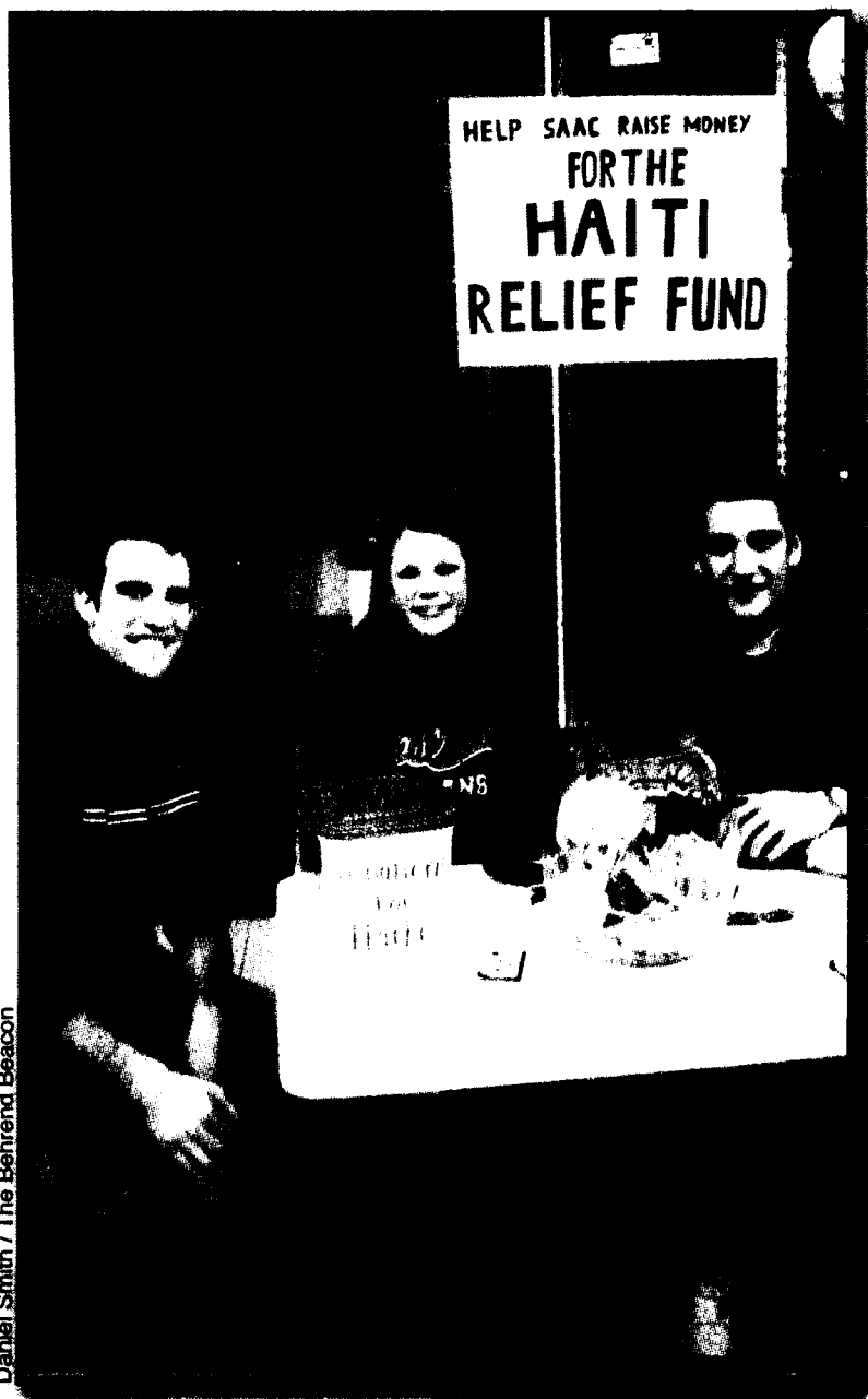
Every member of the Student Athlete Advisory Committee help raise money for the Haiti Relief Fund this past Saturday in the Junker Center and raised over $100 for the benefit.