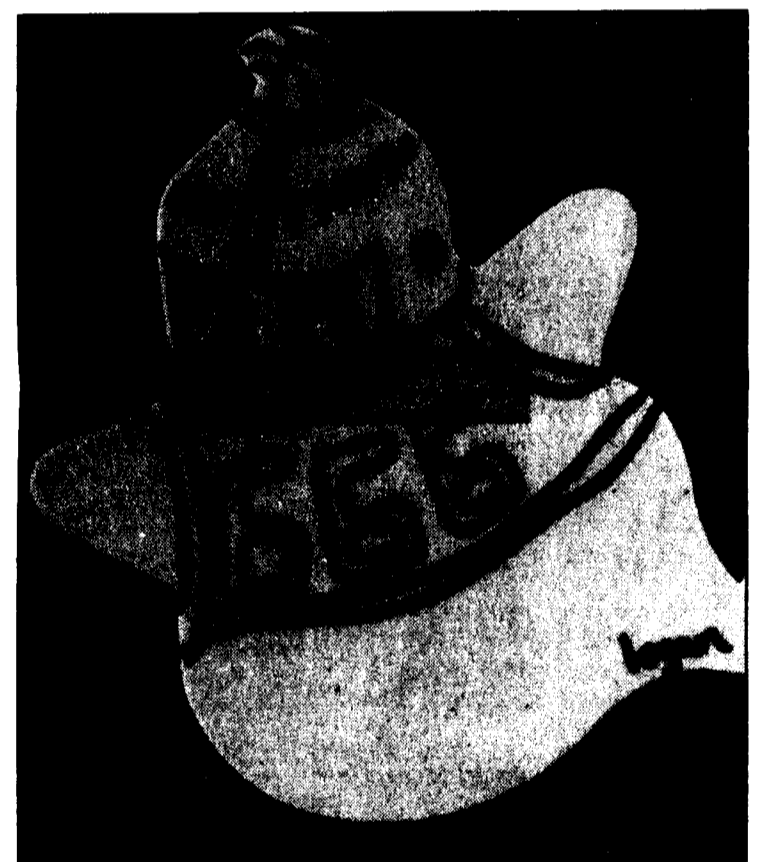
A THON fundraiser cut-out was left after similar decorations with the SKN letters were taken down. The decorations in question have been replaced with the offending letters removed.