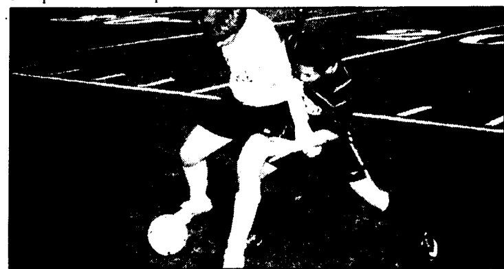
(Left) In such a low-scoring match-up, ball control often decided momentum in the game.