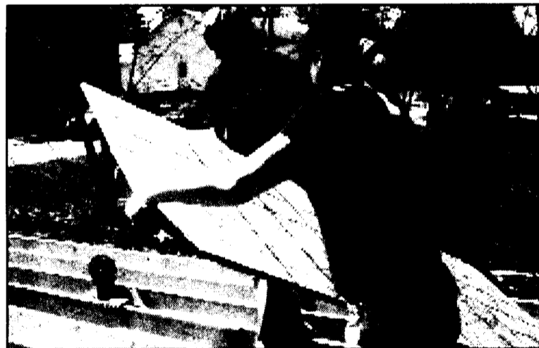
Behrend volunteers helped lay the foundations for a house that Reality Check will work on in November.