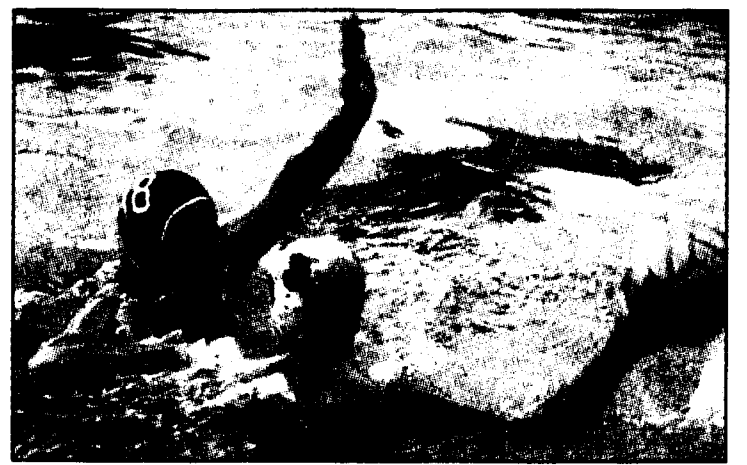
Jon Klein / The Behrend Beacon