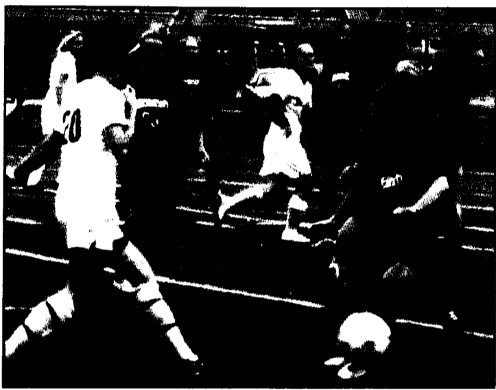
Morgan Rapo / The Perspective

The team will travel to Mount Aloysius (0-6) in conference play, Oct. 24 and have one conference game remaining.