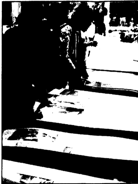
On Sept. 8 and 9, students browsed through the posters that were displayed in the Reed Union Building for the annual sale.