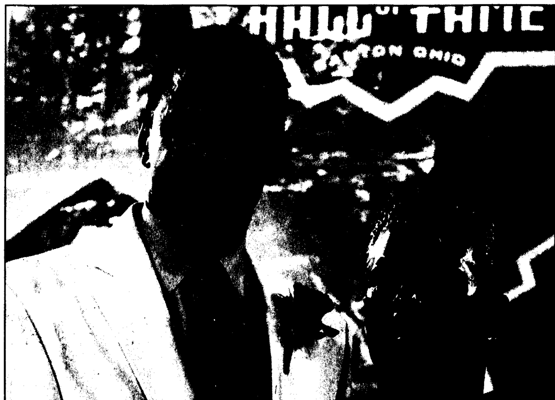
Rod Woodson poses as he is inducted into the Pro Football Hall of Fame.