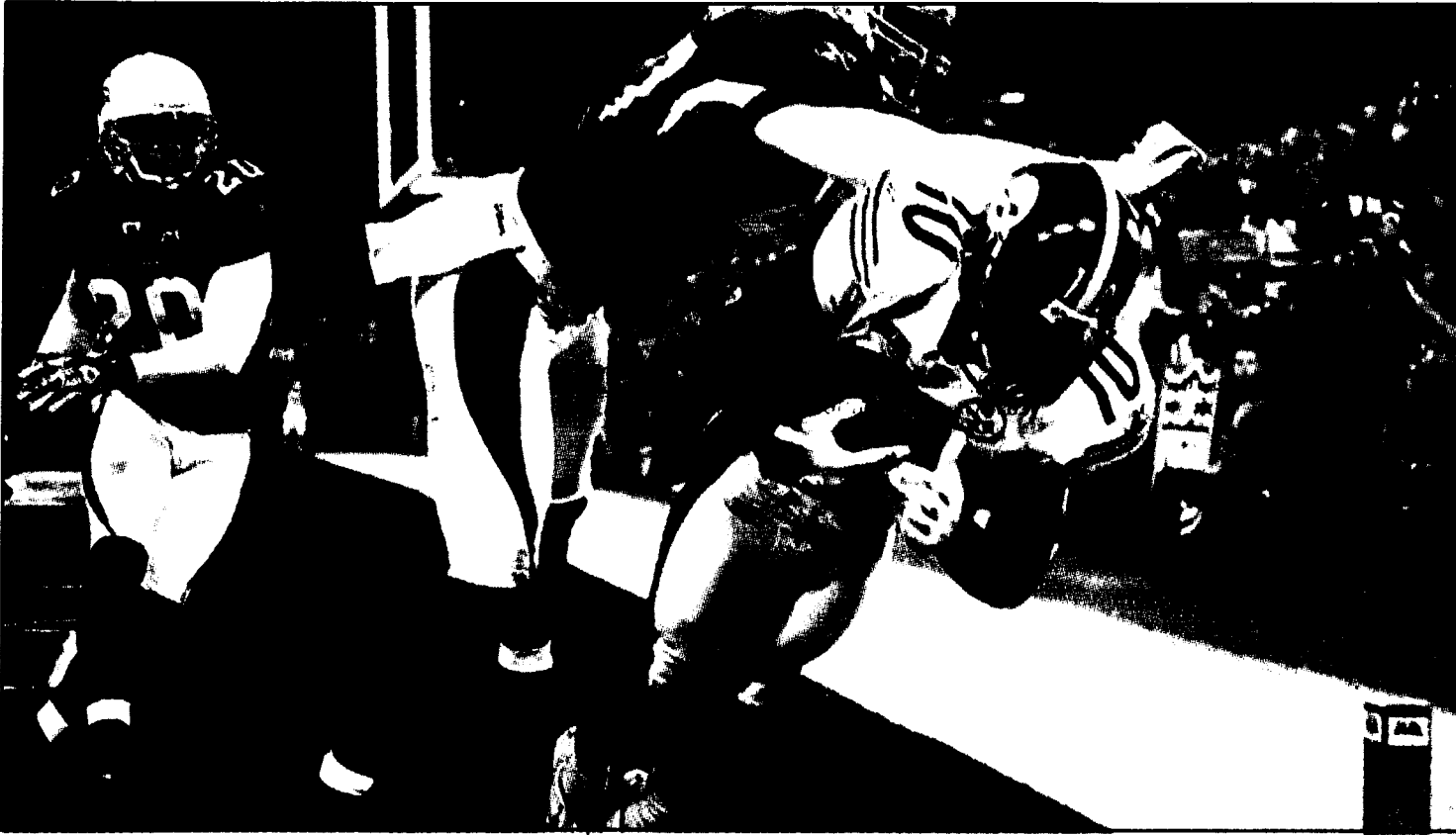
Super Bowl XLIII MVP Santonio Holmes hauls in the game winning touchdown at the end of the fourth quarter.

Don't forget to catch all of your favorite NFL all-stars in this year's Pro Bowl. The game will be in Honolulu, Hawaii on Feb. 8 at 4:30 p.m. on NBC.