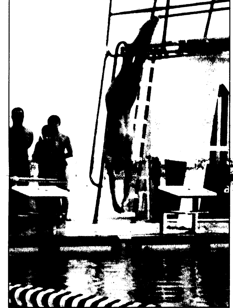
The Behrend swimming and diving team claimed the AMCC title.

Van Epps was named first team all-AMCC in the 200 fly as well as the 200 free relay, 400 medley relay, and 400 free