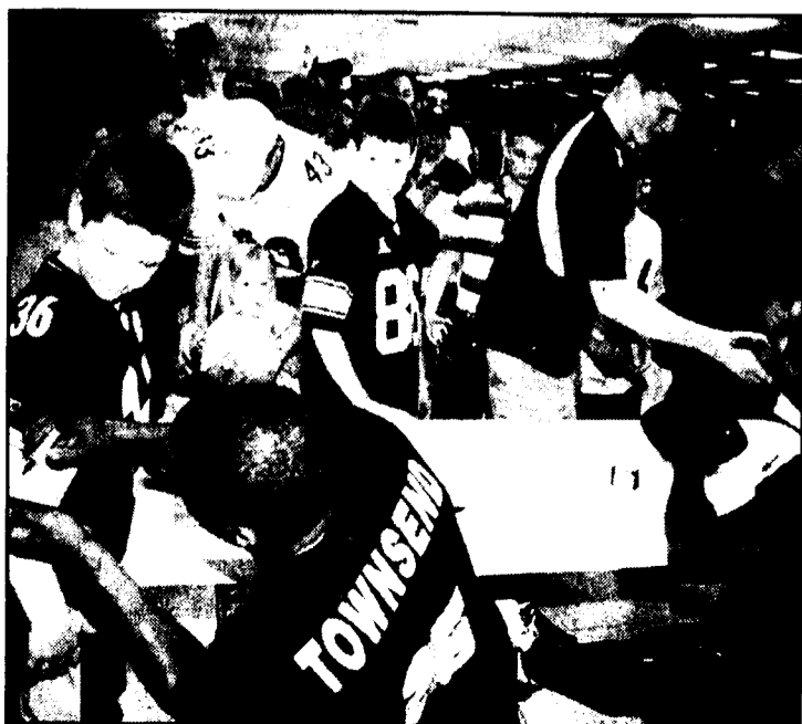
Steelers cornerback Deshea Townsend signs autograph.

According to the Behrend website, individual appearances are subject to player availability and all players will not be at every game.