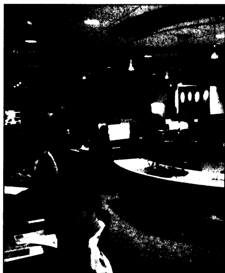
New computer labs are one of many technological upgrades Behrend is undergoing.