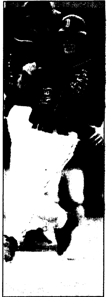
The Lions swept Pitt-Greensburg.