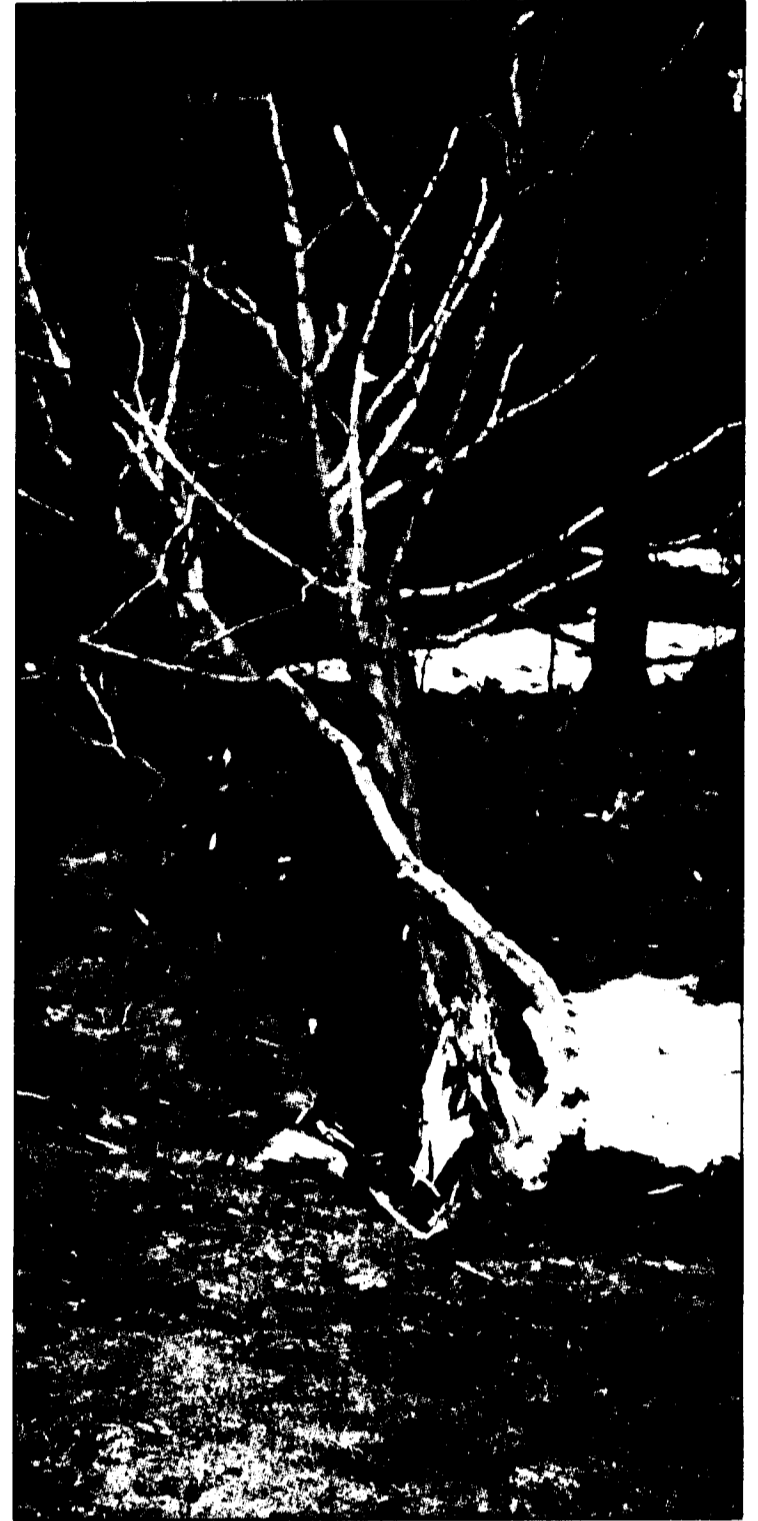
JON KLEIN for The Behrend Beacon

To see if the extreme winds will continue, see Beacon meteorologist Matt Alto's weather forecast on page 2.