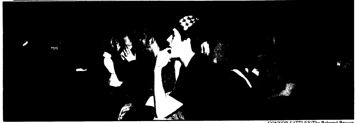
Behrend students applaud and cheer on the contestants at the Price is Right event.