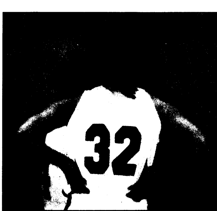
Nowacinski stands and waits for the game to resume