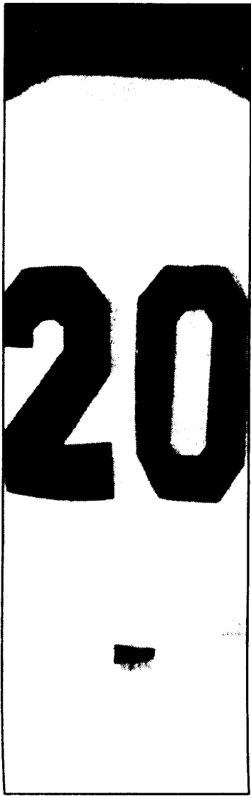
Behrend Lions THE BEHREND BEACON