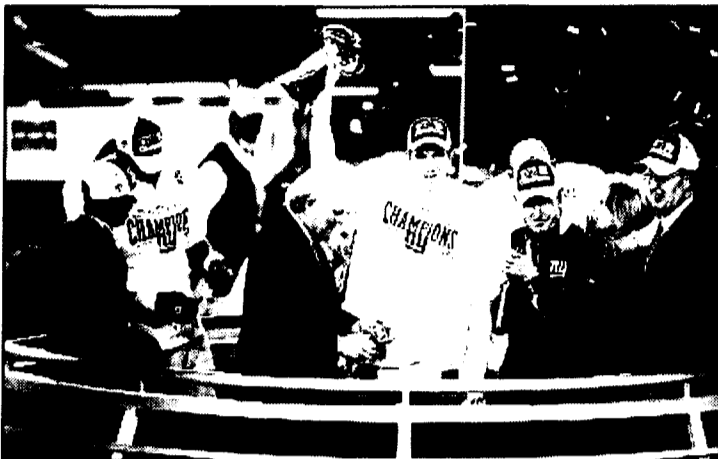
New York Giants quarterback Eli Manning hoists the Lombardi Trophy