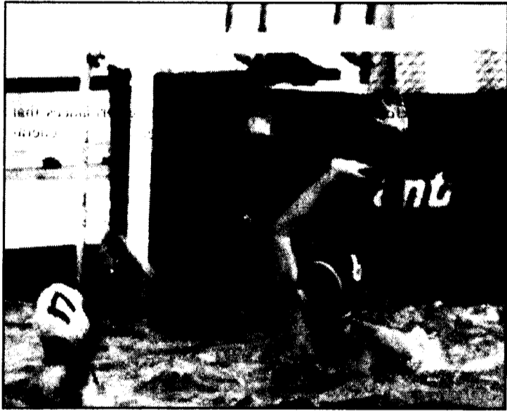
Behrend players work hard to defend their goal

The Lions' good finish at the Eastern Championships, said the coach, will be a great way to lead into the next games. They're going to be a great stepping stone to the Southern Championships, he said.