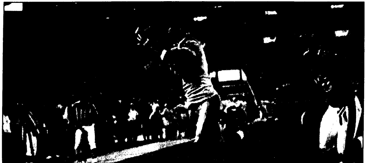
Top: Steelers linebacker LaMarr Woodley(56) sacks Jaguars quarterback David Garrard. Bottom: Steelers wide receiver Hines Ward catches the game winning touchdown pass.