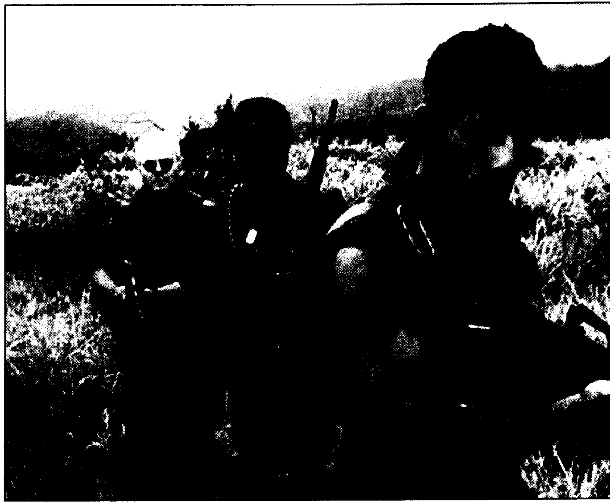
Ben Stiller, Jack Black and Robert Downey Jr. play "dudes playing other dudes" in Tropic Thunder .