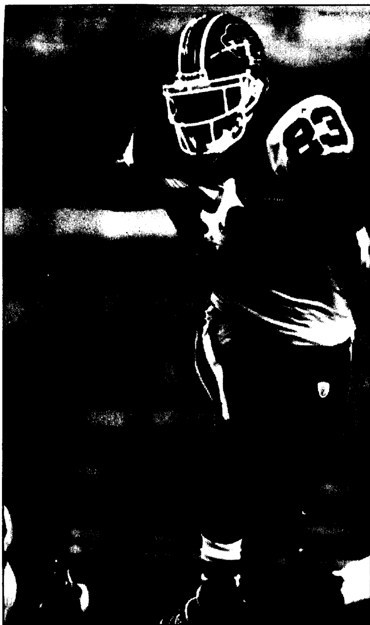
Buffalo Bills RB Marshawn Lynch.