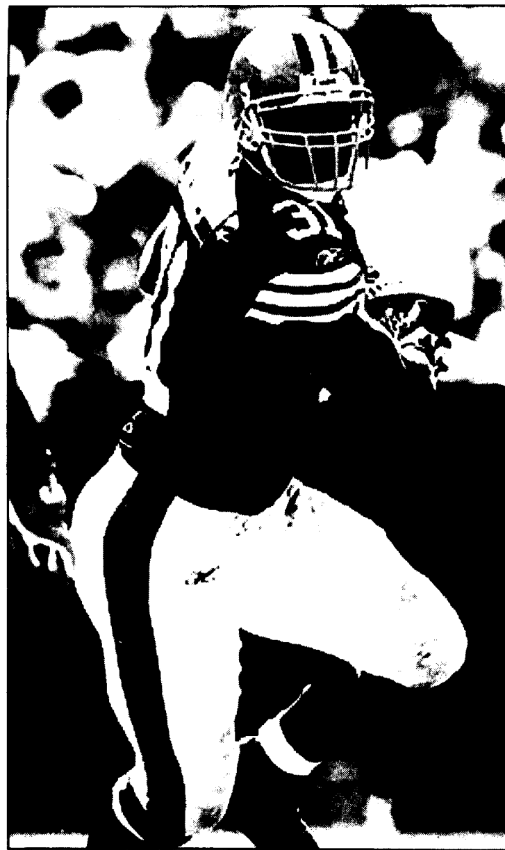
Cleveland Browns RB Jamal Lewis.