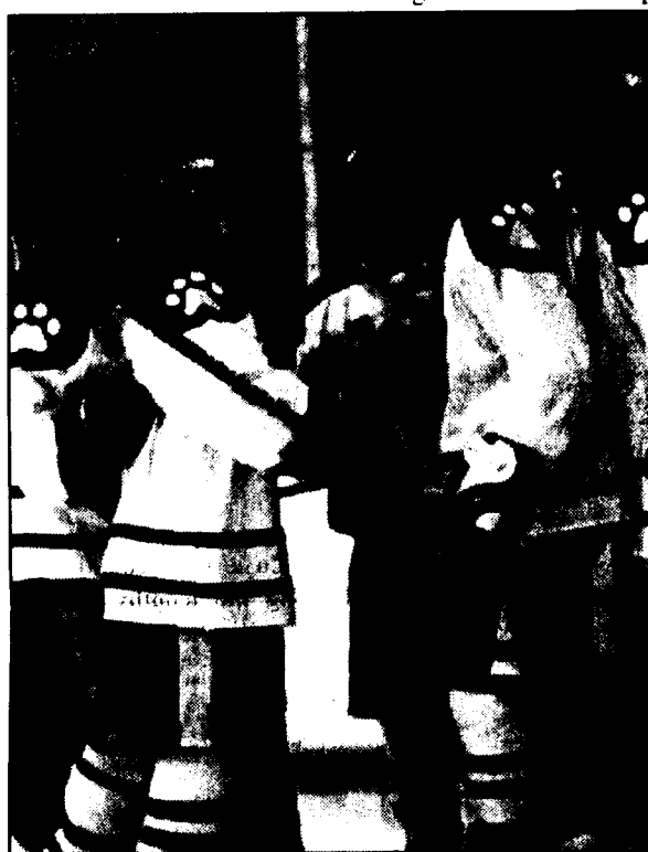
Behrend Hockey looks for first CHE title

In their first matchup at regionals, Behrend played division rival Robert Morris in a grudge match from the week before. On Feb. 10, Behrend was upset by Robert Morris 5-1, setting up an interesting first round matchup with the two at regionals.