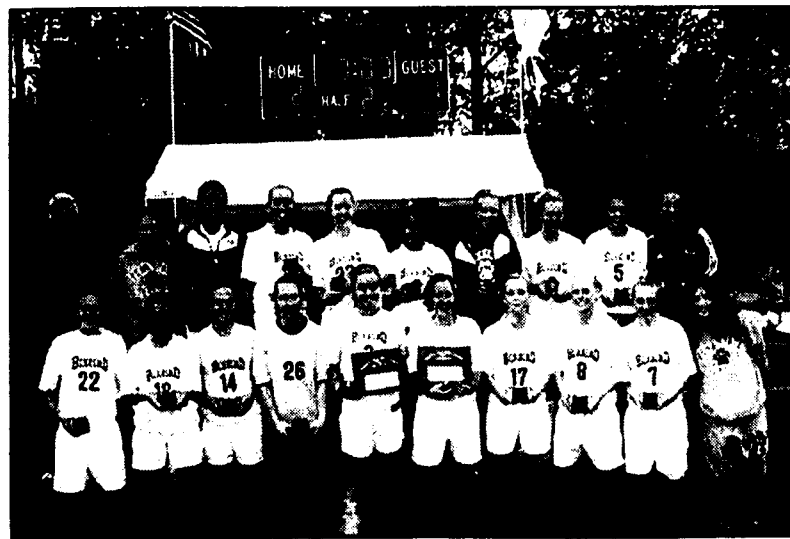
2007 Penn State Behrend Women's Soccer Team