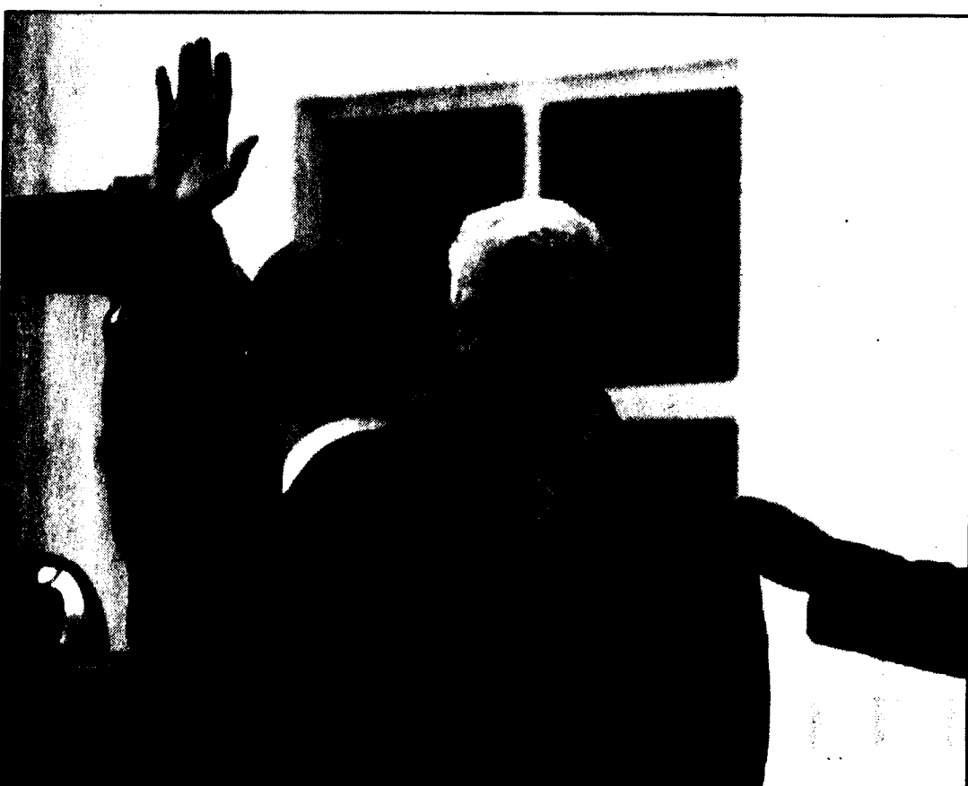
Former President Bill Clinton waves to onlookers as he leaves Erie Hall.

"I would still be here, even if we had never been married," President Clinton said. "Obama is a good speaker, but Hillary has empowerment."