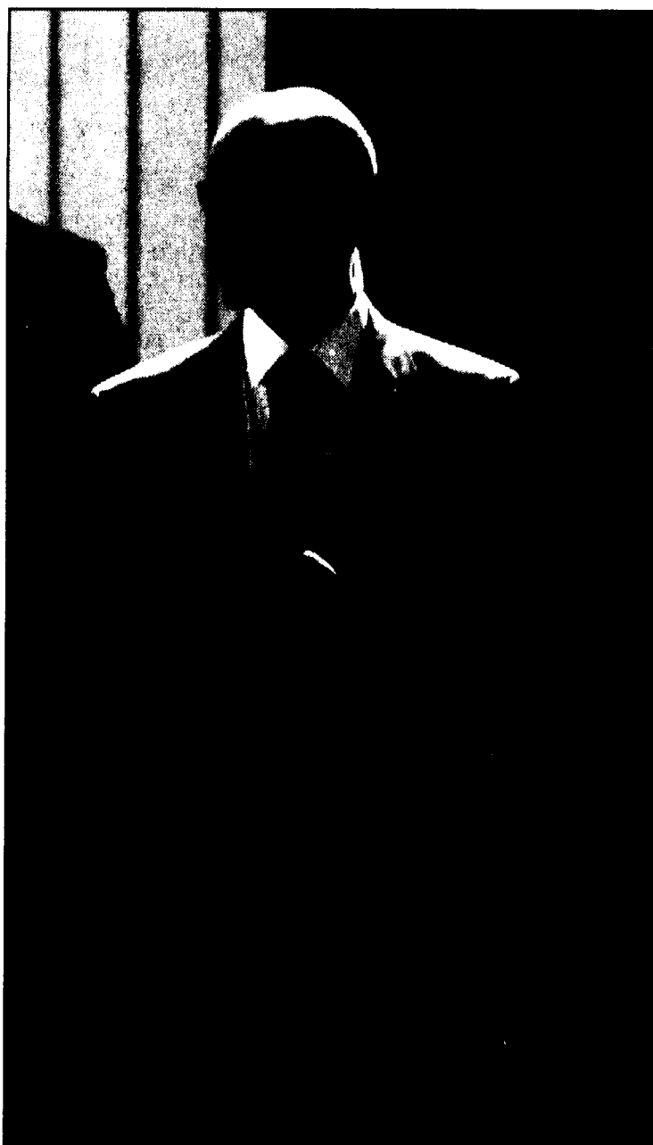
The secret service stands outside of Erie Hall with President Clinton.