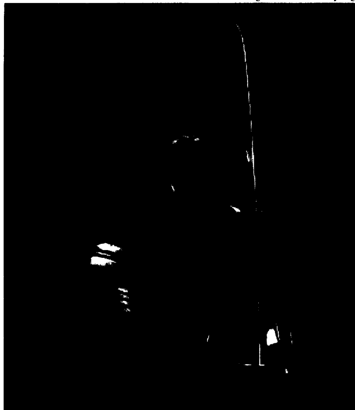
One of only two movie pictures released of Snake Eyes (Ray Park)