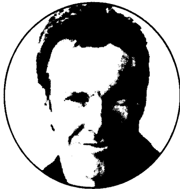
Denis Quaid, who plays Hawk.