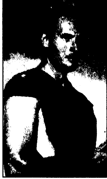
Actor Charlton Heston.