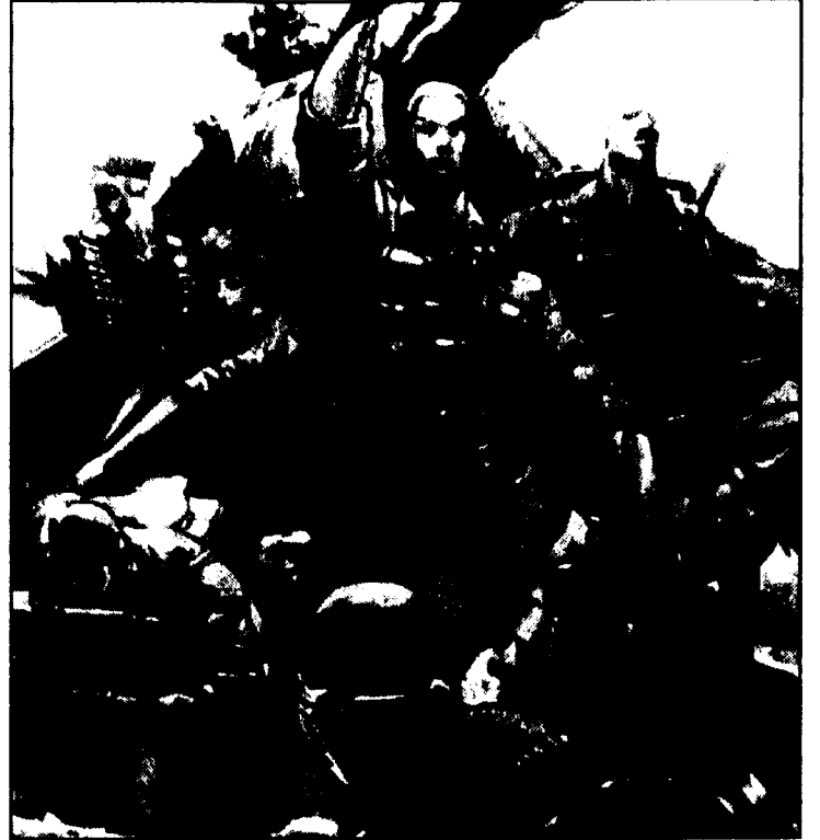
An old-school GI Joe photo starring the famous team.