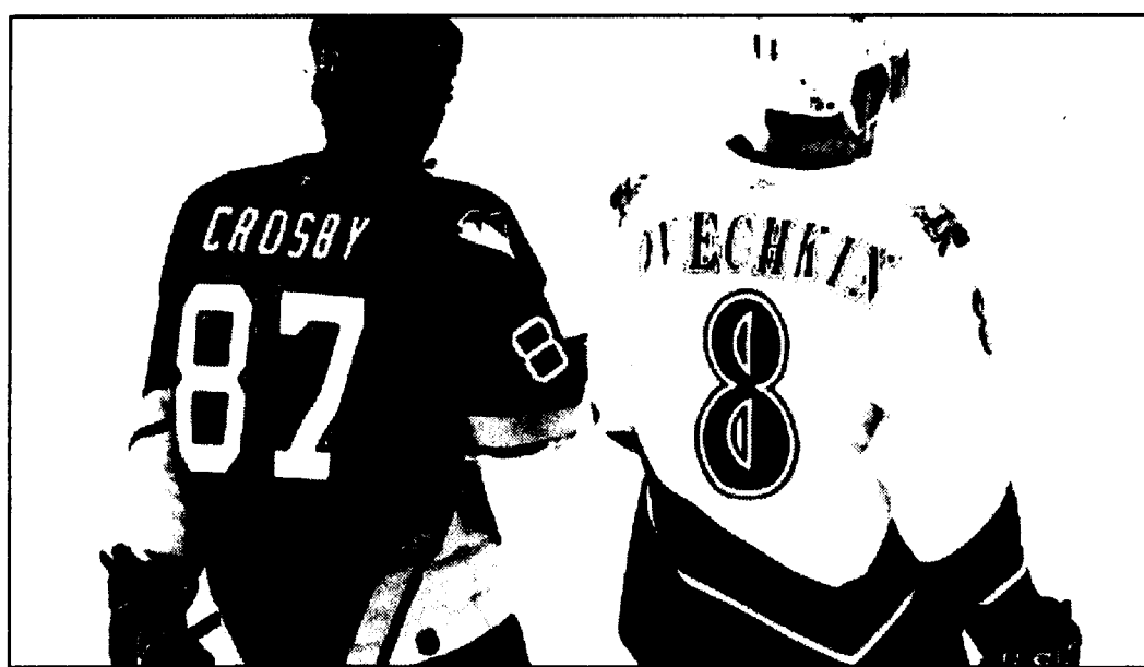
Crosby and Ovechkin have led the youthful dominance that has taken place since the lockout in 2004.

Malkin trails Ovechkin in overall points by a mere four points. An interesting aspect of this statistic, which I found amazing, was the fact that Malkin has taken 173 fewer shots than Alex O. My question is, if Ovechkin is taking so many shots, how could you not expect 65 goals from him, being the athlete that he is? When you take 441 shots, I