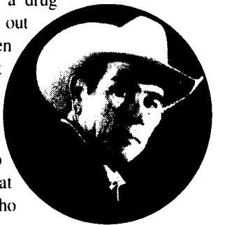
Actor Tommy Lee Jones

I saw this film last Wednesday night and really enjoyed it. The more I think back on it, the more I appreciate it. All the actors in the film are absolutely amazing. Most effective is Javier Bardem's character Anton Chigurh who is entirely terrifying and psychotic. I highly recommend this film to anyone who does not just want to watch a violent crime movie, but who likes a heavily character driven film with numerous moral implications. Some scenes will truly blow you away, making you uneasy and surprised.