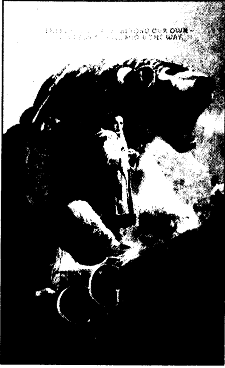
The Golden Compass released amidst public protest and controversy.

Either way this controversy spins, there is a facet that brings the film and the books alike more publicity. It was a great movie, well worth the money spent to see it at the theatre on opening night.