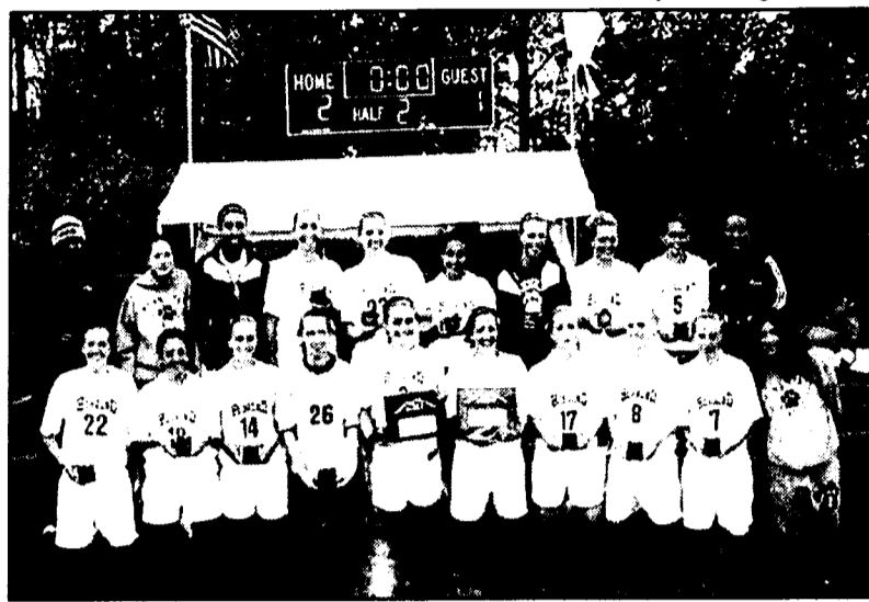
2007 Penn State Behrend Women's Soccer Team

The girls will travel to Springfield, Ohio to take on Wittenberg University (17-2-2) in the first round of the NCAA Tournament. Last year, the girls were