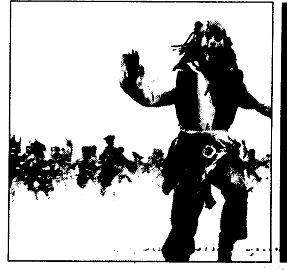
Bad Idea: Captain Jack Sparrow Good Ideas Inigo Montoya (Pirates of the Caribbean)

What do you get when you mix a crowbar, works as well as Communism. You either a physicist, and an alien invasion? You get a couple of kickass costumes for Halloween. If you need to go stag, just say you're playing as Gordon in the first Half-Life!