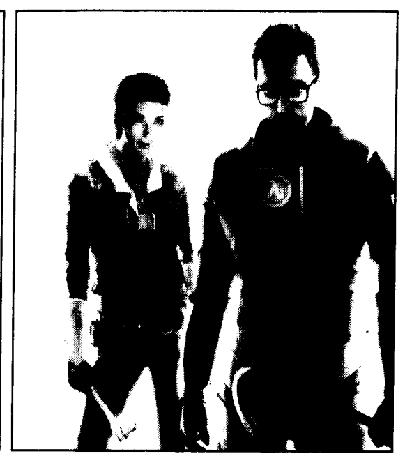
Good Idea: Gordon Freeman and Alyx Vance

In theory, this should be the perfect couple-costume setup, but in practice, this have a hot Princess and fugly Mario, or a fat ugly Princess, and a fugly Mario.