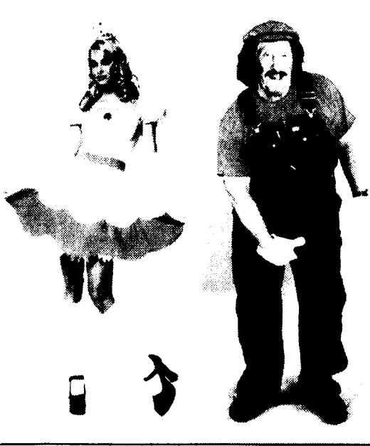
Bad Idea: Mario and Princess (Super Mario Bros.)

Nobody makes fun of the Fuhrer better satirical film making fun of Hitler. Heil Chaplin!