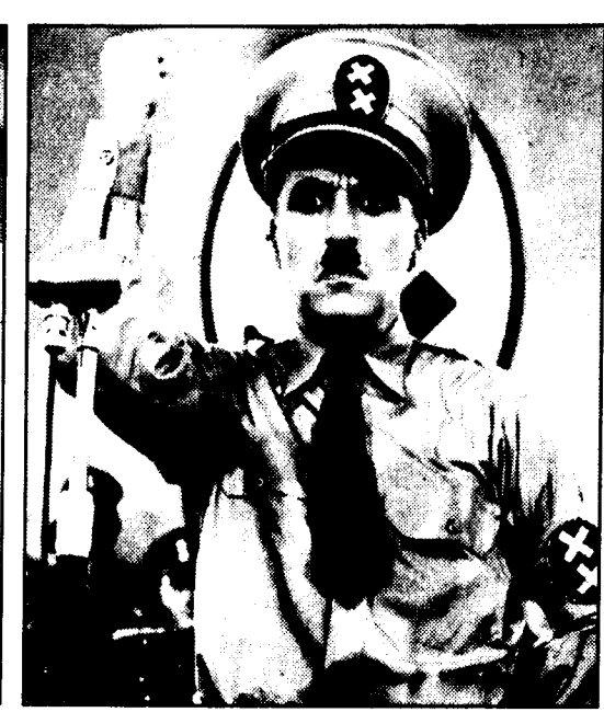
Good Idea: Charlie Chaplin AS Adolf Hitler

To many people, this might come off as tasteless... and it's already been done by every type of person, from red-headed than the little tramp Charlie Chaplin. Irishmen, to blonde-haired, blue eyed her- Chaplin was one of the first to make a maphrodites..