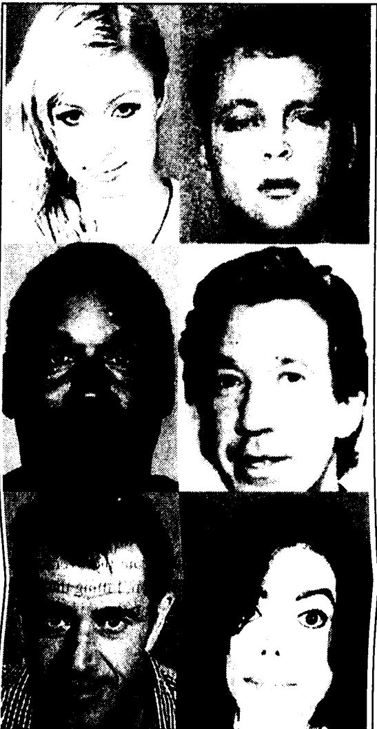
Celebrity Mugshots: Paris Hilton, Vince Vaughn, OJ Simpson, Tim Allen, Mel Gibson, Michael Jackson