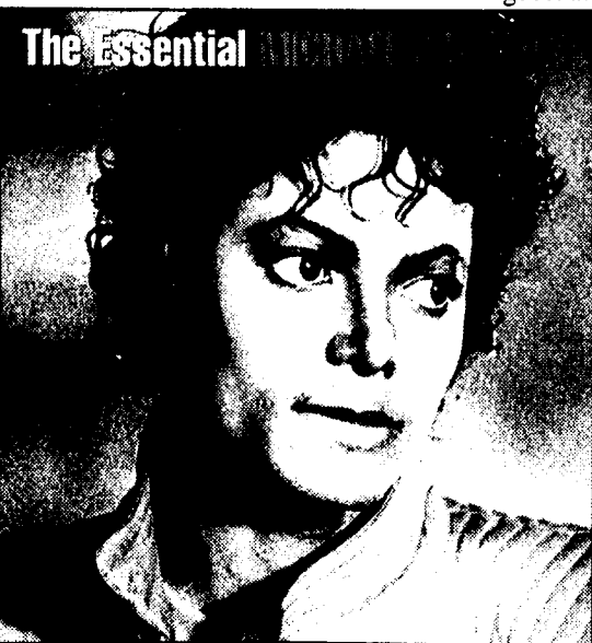
Michael Jackson, pictured above early in his career, is considered by many as the "King of Pop."