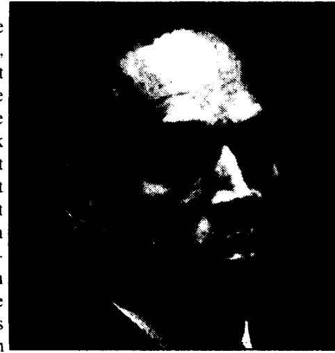
O.J. Simpson's reputation has been tarnished by various legal problems.

Of those possessions seized were Simpson's Heisman Trophy, numerous autographed balls and jerseys, and many of the other awards Simpson received over the years. Some of that memorabilia was the main cause of his recent crimes in Las Vegas. All of the six men involved in the robbery are in custody now and it seems like Simpson is getting charged with the worst of it. His charges include kidnapping, armed robbery, assault with a deadly weapon, and one count of felony coercion. The evidence seems to be stacked against Simpson once again, and it is pretty apparent that he won't be getting out of this one without spending some serious time behind bars.