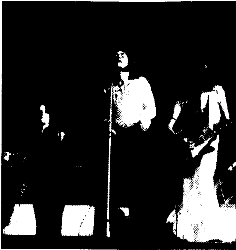
Led Zeppelin has been one of the most successful rock bands in music history.

The British band members came together in Sept. 1968. Comprised of singer Robert Plant, six-string wizard Jimmy Page, bassist John Paul Jones and drum legend Bonham, Led Zeppelin broke all the rules and boundaries that '60s rock and roll had to offer and are regarded as one of the first heavy metal bands. They redefined rock music with a sound saturated by sexuality, mythology, psychedelic funk and a dark aura of mystery. The band has sold more than 300 mil-